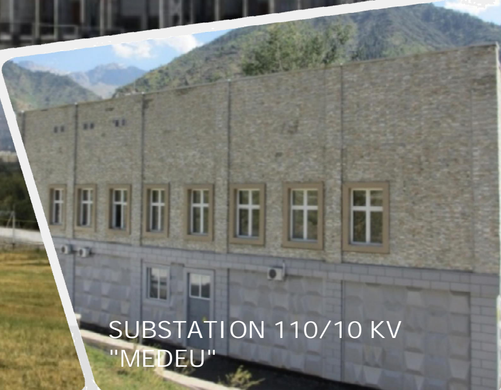
SUBSTATION 110/10 KV "MEDEU"