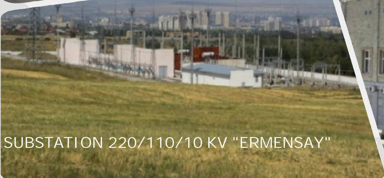
SUBSTATION 220/110/10 KV "ERMENSAY"