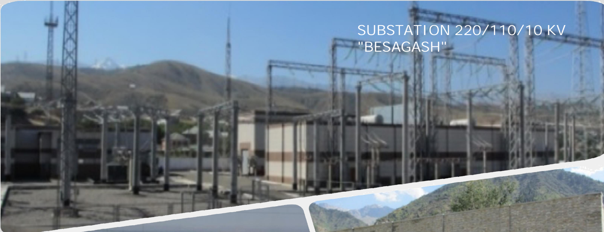
SUBSTATION 220/110/10 KV "BESAGASH"